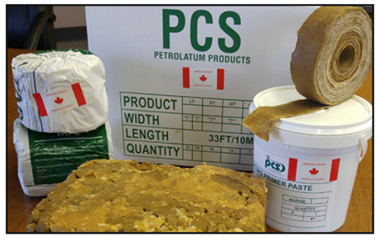
Related products include Petro Filler, PCS Primer and Mastic and Filler.