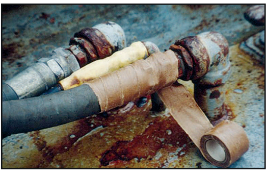
PCS Tape is wrapped on fittings. 50% overlap recommended.