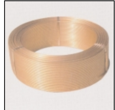
SOFT LEVEL WOUND COILS

Larger sizes available upon request upto 28mm.